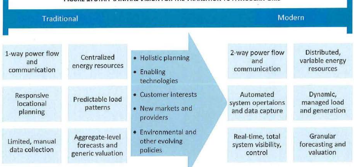
FIGURE 1: STAFF'S INITIAL VISION FOR THE TRANSITION TO A MODERN GRID

Staff envisions DSP as a critical step in moving the state's expectations for a modern gird forward. While a more precise long-term vision for the modern grid will develop through the implementation of DSP, Staff foresees an eventual transition to a more responsive platform that is capable of minimizing the frequency and impact of outages (e.g., automated outage restoration), supporting decarbonization (e.g., better integrating renewables), optimizing system performance (e.g., volt-var management), and enabling customers to deploy DERs in a manner that minimizes their costs while maximizing system benefits (e.g., more accessible hosting capacity data, advanced price signals.)<sup>5</sup>