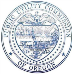
Mark R. Thompson Commissioner

A party may request rehearing or reconsideration of this order under ORS 756.561. A request for rehearing or reconsideration must be filed with the Commission within 60 days of the date of service of this order. The request must comply with the requirements in OAR 860-001-0720. A copy of the request must also be served on each party to the proceedings as provided in OAR 860-001-0180(2). A party may appeal this order by filing a petition for review with the Circuit Court for Marion County in compliance with ORS 183.484.