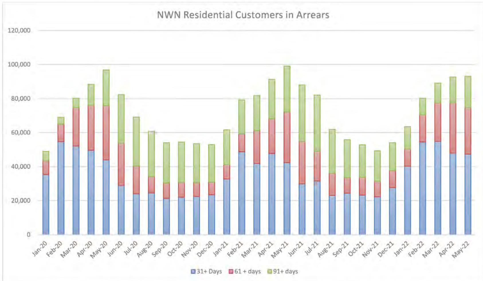
Figure 3 - Residential Customers in Arrears