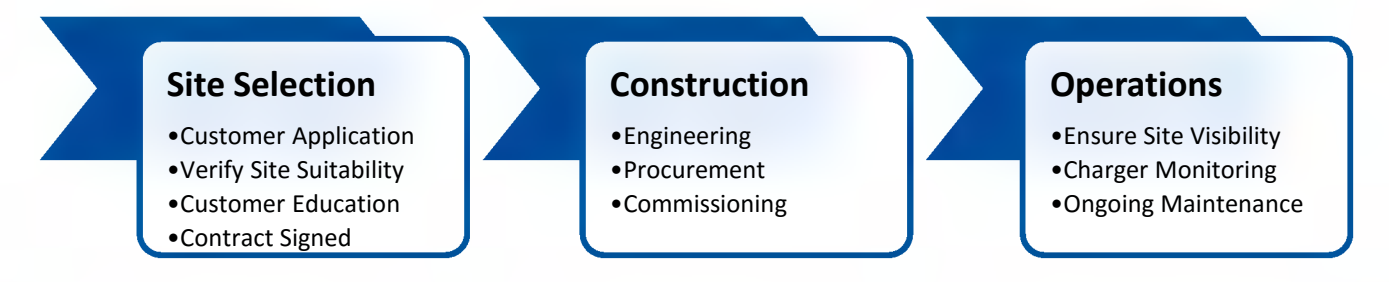
Figure 2 Pilot Program Process Overview (Business EV Charging)