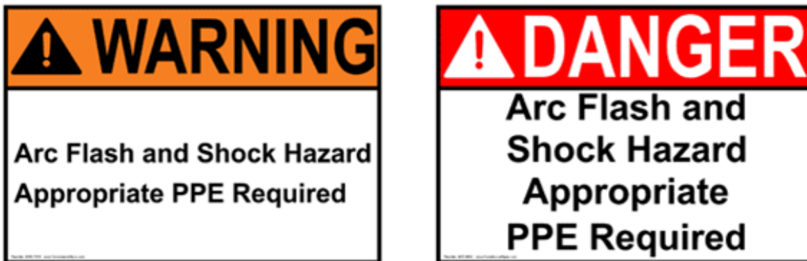
Figure 2.2. Example Arc Flash Hazard Warning Labels