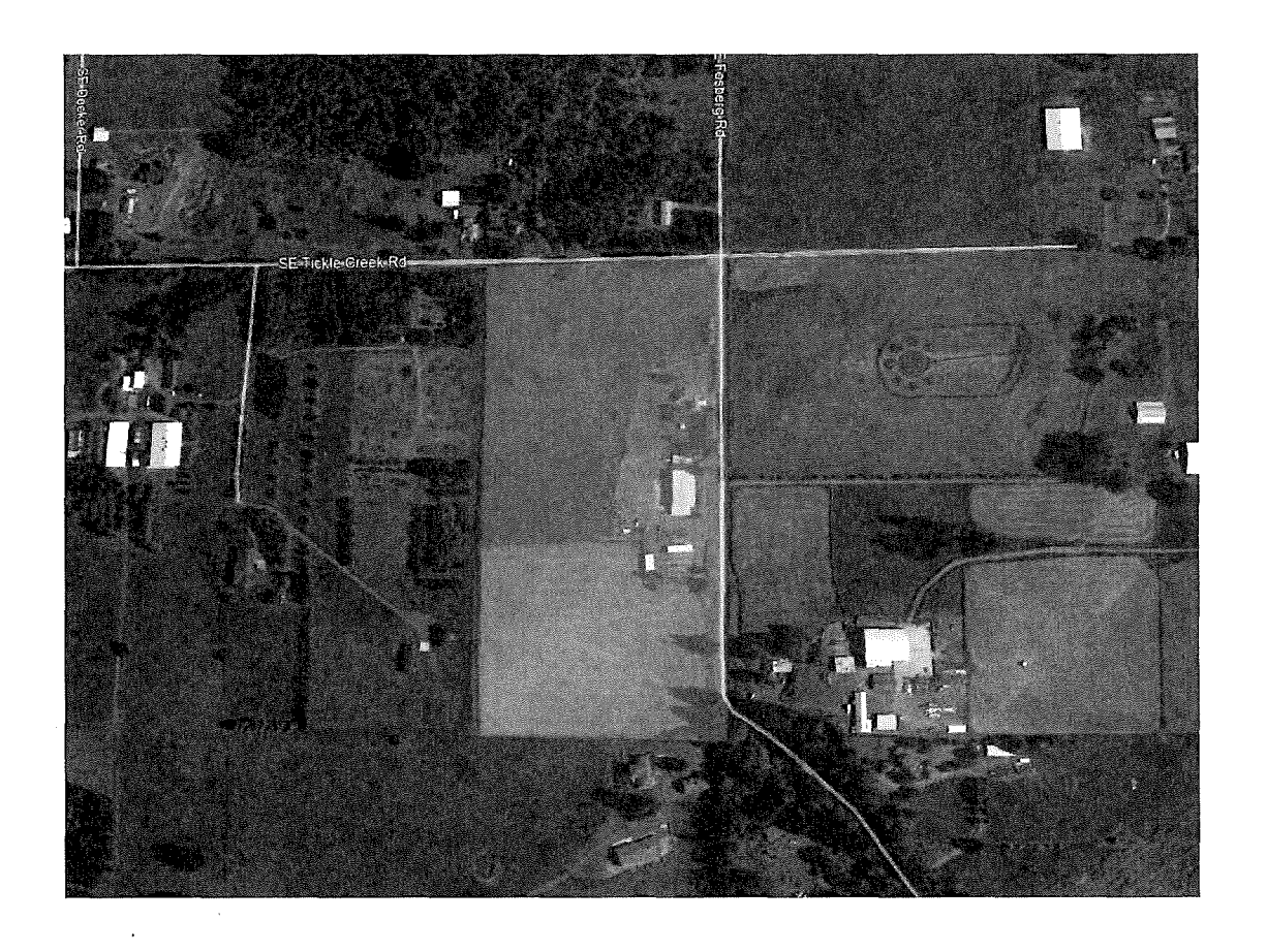
Appendix 1:DEPICTION/DESCRIPTION OF PROPERTY