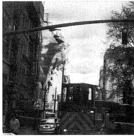
Scaffolding on a building project located at Southwest Fourth and Washington came crashing down on the street, hitting at least one vehicle.