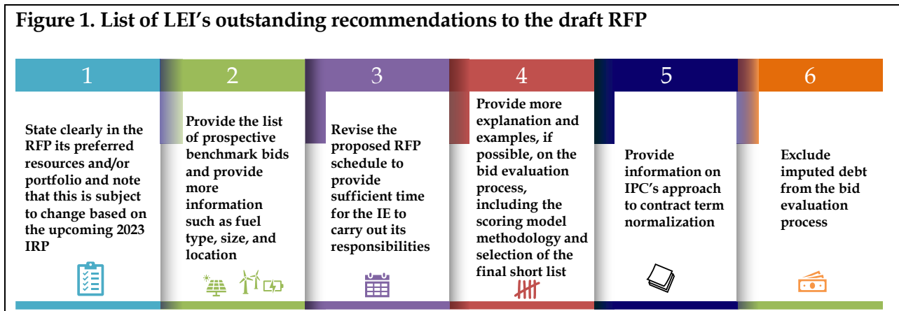
Figure 1. List of LEI’s outstanding recommendations to the draft RFP

Stakeholders present at the Workshop also had several comments on the draft RFP that they received via email communication on February 15, 2023. These main comments are listed in Figure 2 below and discussed in detail in Section 4.