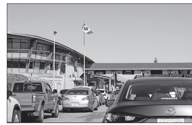
Traffic enters Canada from the United States at the Peace Arch Border Crossing in Blaine, Wash.

Border guards took their passports, NEXUS cards and car keys, she said. They questioned her about her parents, her education and her Facebook and email accounts, she said, and asked her husband about the military service he was required to perform in Iran