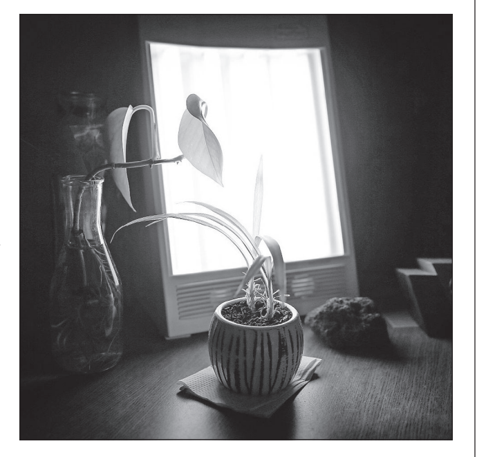
The sun lamp is 10,000 lumens and simulates sunlight. A person using a sun lamp should not look directly into the light, but rather let it sit adjacent to the user.

be assessed for major respectively. depression first. The depression still applies to a seasonal component – with some nuances.