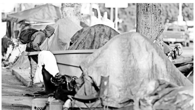
Tents and debris are piled on top of one and 2019. A no-camping ordinance, similar to the ercial St. NF n o effect in the City of Keize