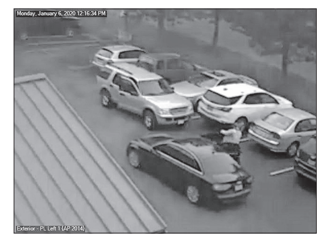
Two vehicles appear to box in the victim's vehicle in Monday's possible kidnapping at the West 11th Avenue Target store.