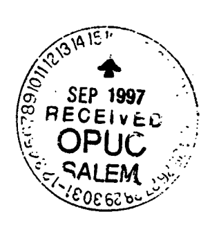
Exhibit 3 Page 4 of 7

Effective: October 22, 1997 Title Vice President