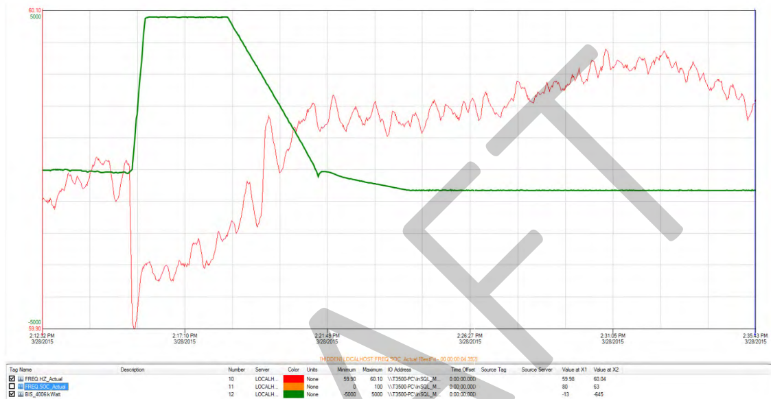
Figure 2 Energy Storage System Frequency Response

This service shall be provided up to 50 times per year, and sometimes within the same 8-hour period.