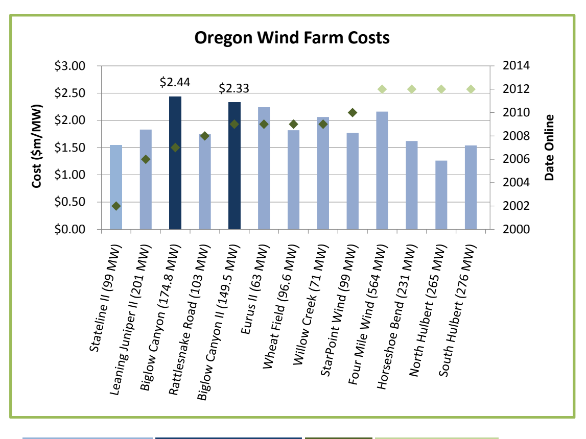
IPP-Developed Projects Utility-Developed Projects Date Online Projected Date Online

PGE's ability to mitigate the risks and manage the costs of resource ownership across all technologies and fuel types, and across multiple projects of significant size, scope and complexity, depends on PGE's capabilities to successfully develop, construct and operate all of the projects that it undertakes. Moreover, PGE ignores the fact that under a utility ownership structure, the utility and its customers bear all project risks and costs, regardless of whether the utility is able to manage those risks and costs. Under a PPA structure, project risks can be shifted to a third party; customers are not dependent on their utility to successfully mitigate and manage those risks.