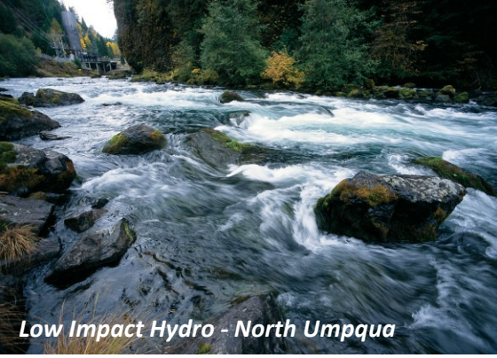
Low Impact Hydro - North Umpqua