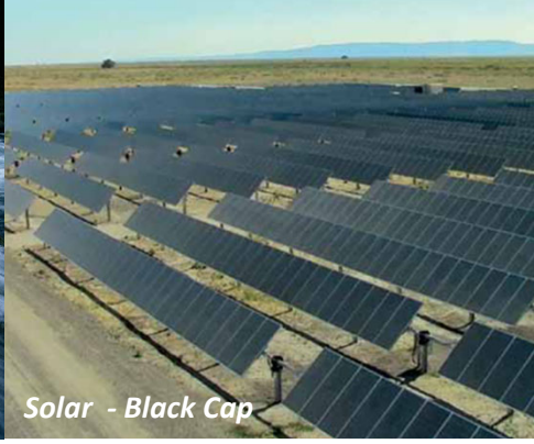
Solar - Black Cap