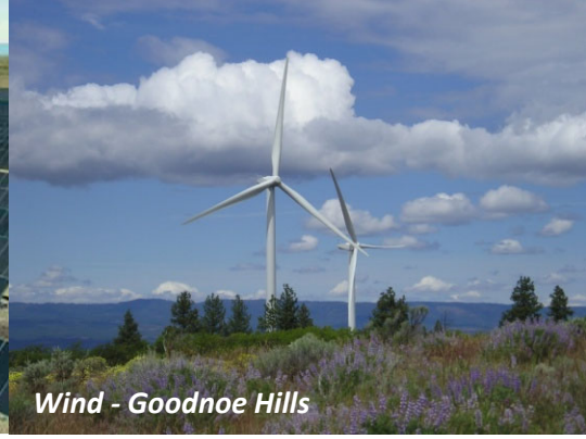
Wind - Goodnoe Hills