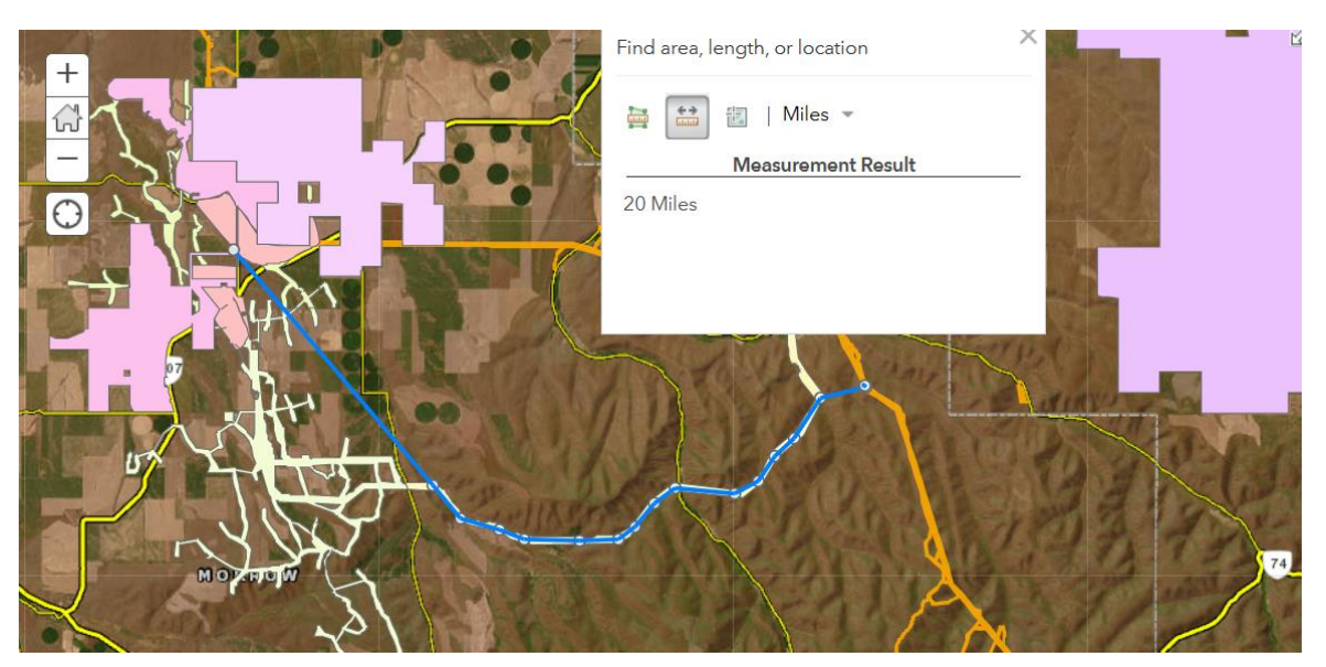
Exhibit 1: New Alternate Route Option A (blue) IPC proposed route (orange)

Option A is an alternate route that leaves the proposed route at MP 19.3 and continues its South East trajectory to the point on Spur Loop Road that intersect the Wheat Ridge Renewable Energy Facility East. It parallels the Wheat Ridge corridor south of Gleason Butte, departs the corridor at Ayers Canyon and reconnects with the proposed route at MP 36.