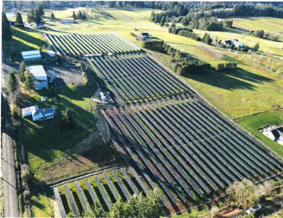
Auburn Solar as of December 12, 2023

Realistic Timeline to Achieve Commercial Operations We expect that Auburn Solar will reach commercial operations by August 1, 2024 based on the timeline for Low-Income Subscriber acquisition estimated by CEP.