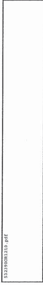
Name of Attached Document

<010> Study Area Code 532390 <015> Study Area Name OREGON-IDAHO UTIL. <020> Program Year 2018 <030> Contact Name - Person USAC should contact regarding this data Doug Musgrave <035> Contact Telephone Number - Number of person identified in data line <030> 2084617802 ext. <039> Contact Email Address - Email Address of person identified in data line <030> doug_musgrave@statelecom.net