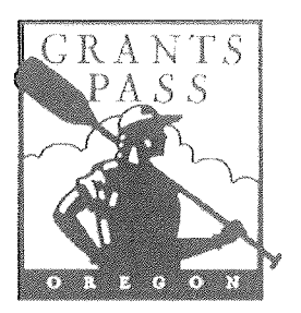
WHERE THE ROGUE RIVER RUNS