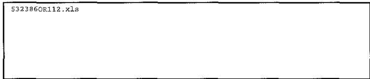
Name of Attached Document

<112> Attach Five-Year Service Quality Improvement Plan or, in subsequent years, your annual progress report filed pursuant to 47 C.F.R. § 54.313(a)(1). If your company is a CETC which only receives frozen support, your progress report is only required to address voice telephony service.