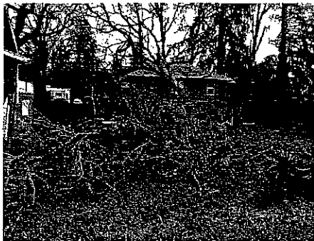
This home on Railroad Avenue in the south St. Helens area was struck by a falling tree during the windstorm that brought gale-force winds to the region Thursday, Dec. 11.